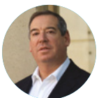
Ivor Ichikowitz Founder of Paramount Group

Kazakhstan and Africa are forging a dynamic partnership driven by shared priorities in economic growth, sustainable development, and global stability. Despite geographical distance, both Kazakhstan and Africa nations have rapidly evolving economies, abundant natural resources, and growing focus on regional and global integration. As emerging middle powers, they have the potential to shape multipolar cooperation and contribute to sustainable progress. This panel session will explore how both sides can leverage their respective strengths to build long-term, mutually beneficial partnerships across key sectors.