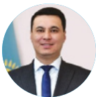
Mansur Oshurbaev Vice- Minister of Ecology and Natural Resources of the Republic of Kazakhstan