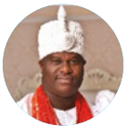
Ooni Adeyeye Enitan Ogunwusi King of Ife