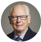
Lord Francis Maude Member of the House of Lords of the Parliament, United Kingdom