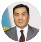
Yerlan Akkenzhenov Minister of Energy of the Republic of Kazakhstan