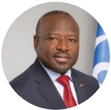
MODERATOR Lassina Zerbo Former Prime Minister of Burkina Faso