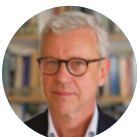
Bruno Tertrais Deputy Director of the Fondation pour la recherche stratégique

The panel will address critical questions: How are traditional alliances being redefined in this more pragmatic landscape? What opportunities and challenges does this present for emerging economies? And what becomes of smaller nations with limited leverage in a system that increasingly rewards negotiating power?