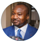
Denis Christel Sassou-N'Guesso Minister of International Cooperation and Promotion of Public-Private Partnerships of the Republic of Congo