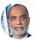
Amandeep Singh Gill UN Under- Secretary- General and Secretary- General's Special Envoy for Digital and Emerging Technologies