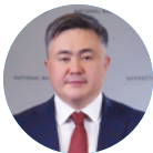
Timur Suleimenov Governor of the National Bank of Kazakhstan