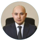
Alibek Kuantyrov Deputy Minister of Foreign Affairs of Kazakhstan