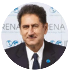
Francesco La Camera Director-General of the International Renewable Energy Agency