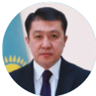
Marat Karabayev Minister of Transport of the Republic of Kazakhstan