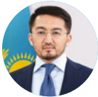
Zhaslan Madiyev Minister of Digital Development, Innovations and Aerospace Industry of the Republic of Kazakhstan