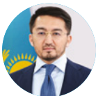
Zhaslan Madiyev Minister of Digital Development, Innovations and Aerospace Industry of the Republic of Kazakhstan