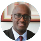
Olivier Jean Patrick Nduhungirehe Minister of Foreign Affairs and Cooperation of the Republic of Rwanda