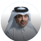
Fahad Hamad Hassan Al-Sulaiti Director General, Qatar Fund for Development

Despite these challenges, these economies offer untapped potential for global growth. Strategic investments in blended finance, climate resilience, human capital, and infrastructure can drive inclusive, sustainable progress. Multilateral institutions, development banks, and private sector partnerships are crucial to unlocking capital and designing adaptive economic policies. Strengthening economic resilience in these regions is not only a matter of equity—it is vital for building a more stable and prosperous global future.