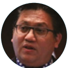
Datuk Nur Zhazlan bin Tan Sri Mohamed Deputy President of the Senate Parliament of Malaysia

Speakers will explore how countries of varying sizes and economic might are adapting to this emerging paradigm—from large powers leveraging economic clout to secure favourable terms, to middle power nations developing innovative strategies to increase their influence.