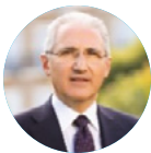
Mukhtar Babayev President of COP29 and Minister of Ecology and Natural Resources of Azerbaijan Republic