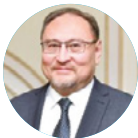
Akan Rakhmetullin First Deputy Minister of Foreign Affairs of the Republic of Kazakhstan

The Pact for the Future, alongside the Global Digital Compact and the Declaration on Future Generations, represents a transformative vision for international relations. These initiatives aim to modernize the global governance system, ensure equitable financial frameworks, advance digital cooperation, and prioritize the interests of future generations in decision-making. The reforms proposed in these agreements seek to restore trust in multilateral institutions, address systemic inequalities, and ensure that global mechanisms remain fit for purpose in the XXI century.